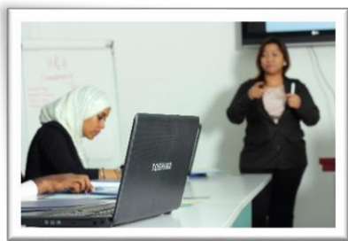
ICDL programs are for anyone who wishes to become fully competent in the use of a computer and common applications.

Tel: 0912946433 Email: Info@hnhconsultancy.com